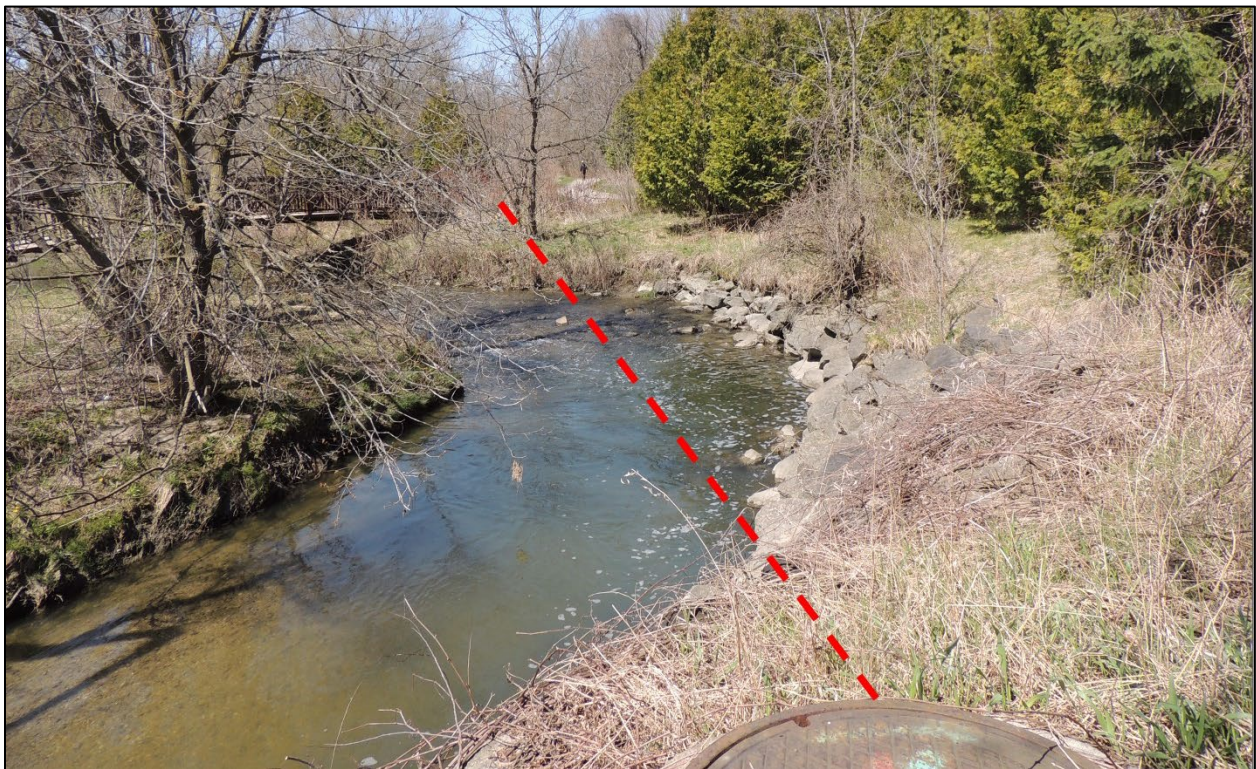
Figure 2. The Leslie Collector main and maintenance hole is at risk of erosion downstream of the pedestrian bridge in German Mills Settlers Park.