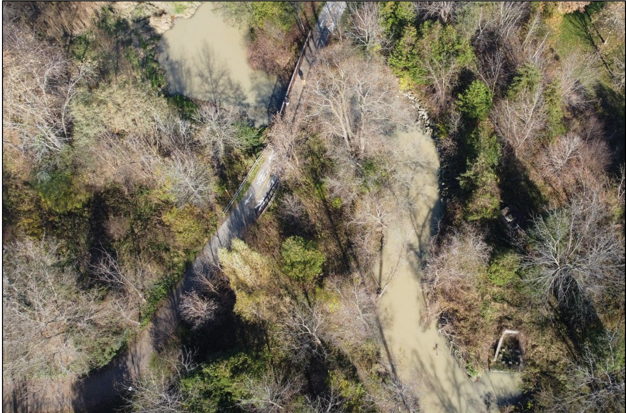
Figure 4. Aerial photo of the south end of project area where the Leslie Collector sewer, pedestrian bridge and trail are at risk of erosion.