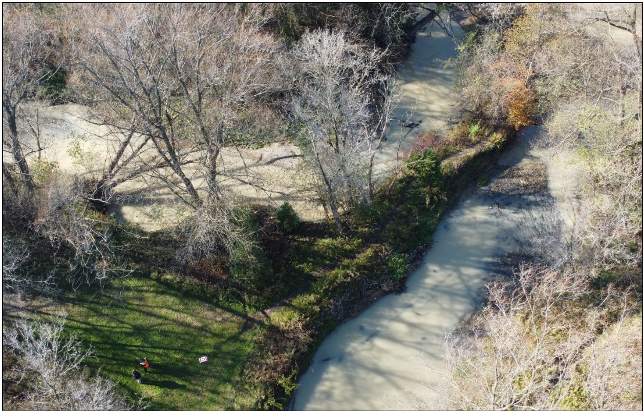
Figure 3. Aerial photo of the north end of project area where the Leslie Collector sewer is at risk from erosion.