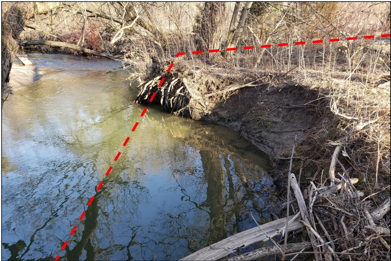
Figure 1. A bank scour and meander cut off is threatening the Leslie Collector sewer at German Mills Settlers Park Sanitary Protection Project Site 2-3.