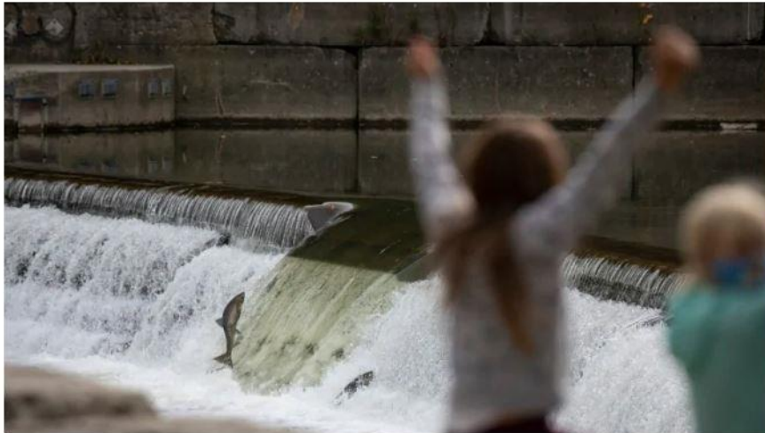
Children cheer on salmon trying to jump over a dam at Toronto's Etienne Brule Park.

Trevor Dunn · CBC News · Posted: Oct 16, 2020 5:00 AM ET | Last Updated: October 16, 2020