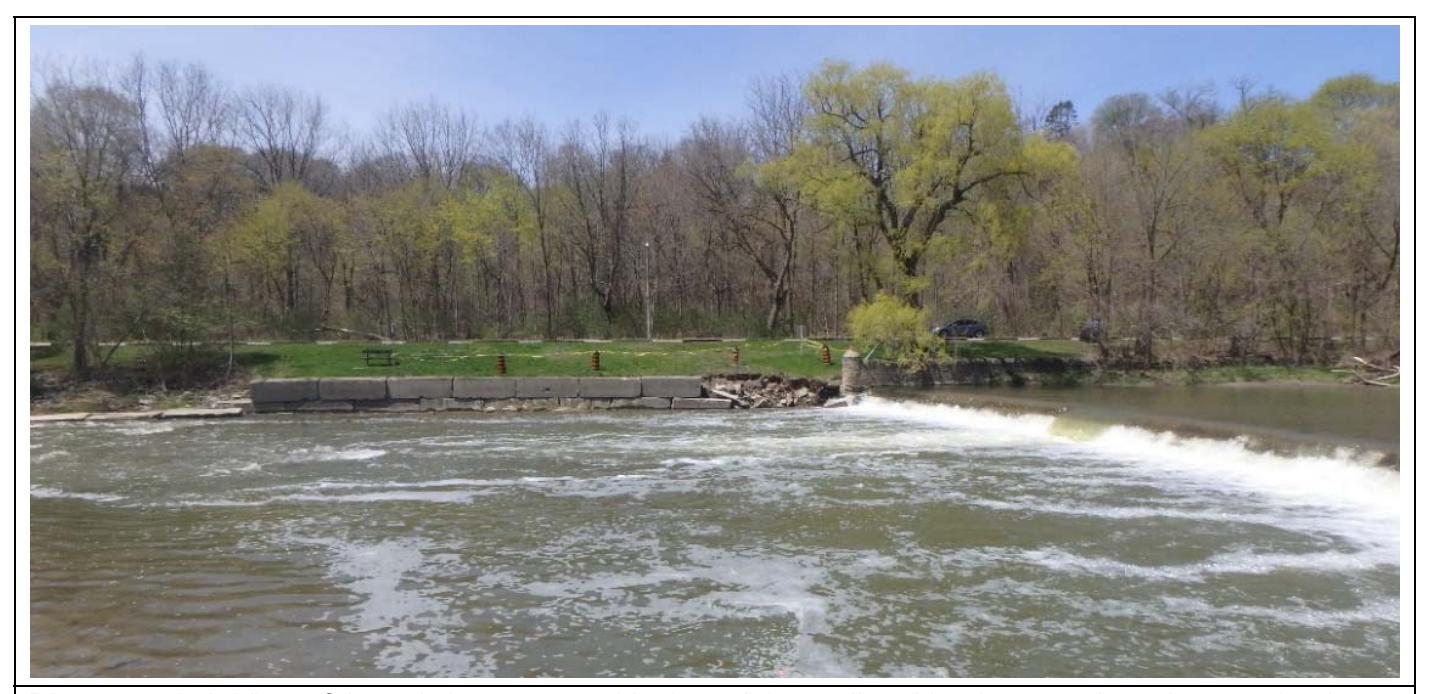
Photograph 1: View of the existing concrete block retaining wall and bank scour along the west bank.