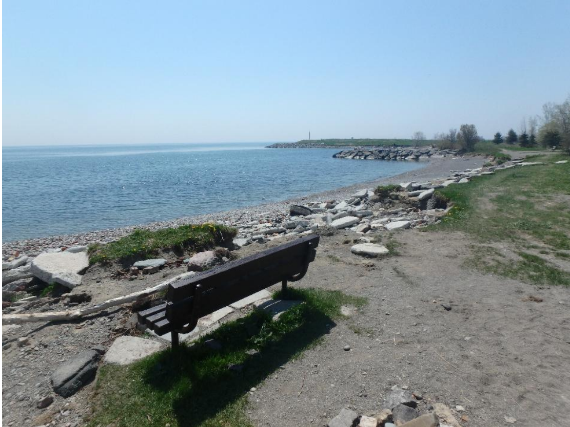
Figure 1. Erosion near public bench at WF04.13.