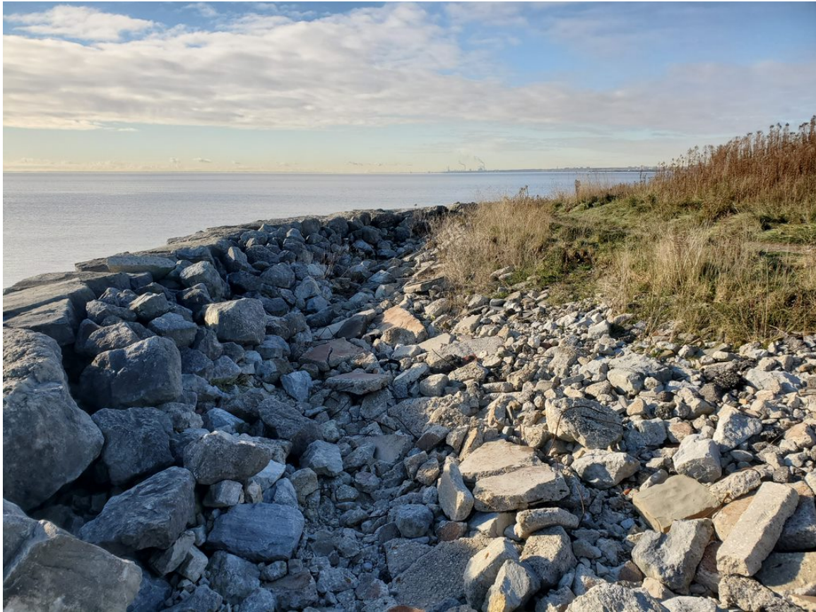
Figure 3. Land view of scoured shore behind headland at Whimbrel Point.